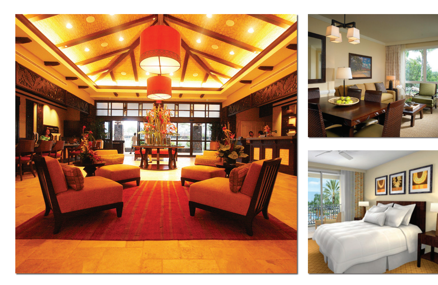
Client: Starwood Project: Westin Princeville Ocean Resort Location: Princeville, Kauai Hawaii

Property Description: The Westin lies along a lush cliff on Kauai's north shore and blends into the inspiring beauty surrounding it. Resting two hundred feet above the Pacific Ocean, all villas have intuitively designed floor plans, the conveniences of home, and the revitalizing comfort characteristics of a Westin property. The Westin consists of; 7 bldg. 172/2 BR, Restaurant, Pool Area, Lobby, General Store, BOH and Sales Galleries.